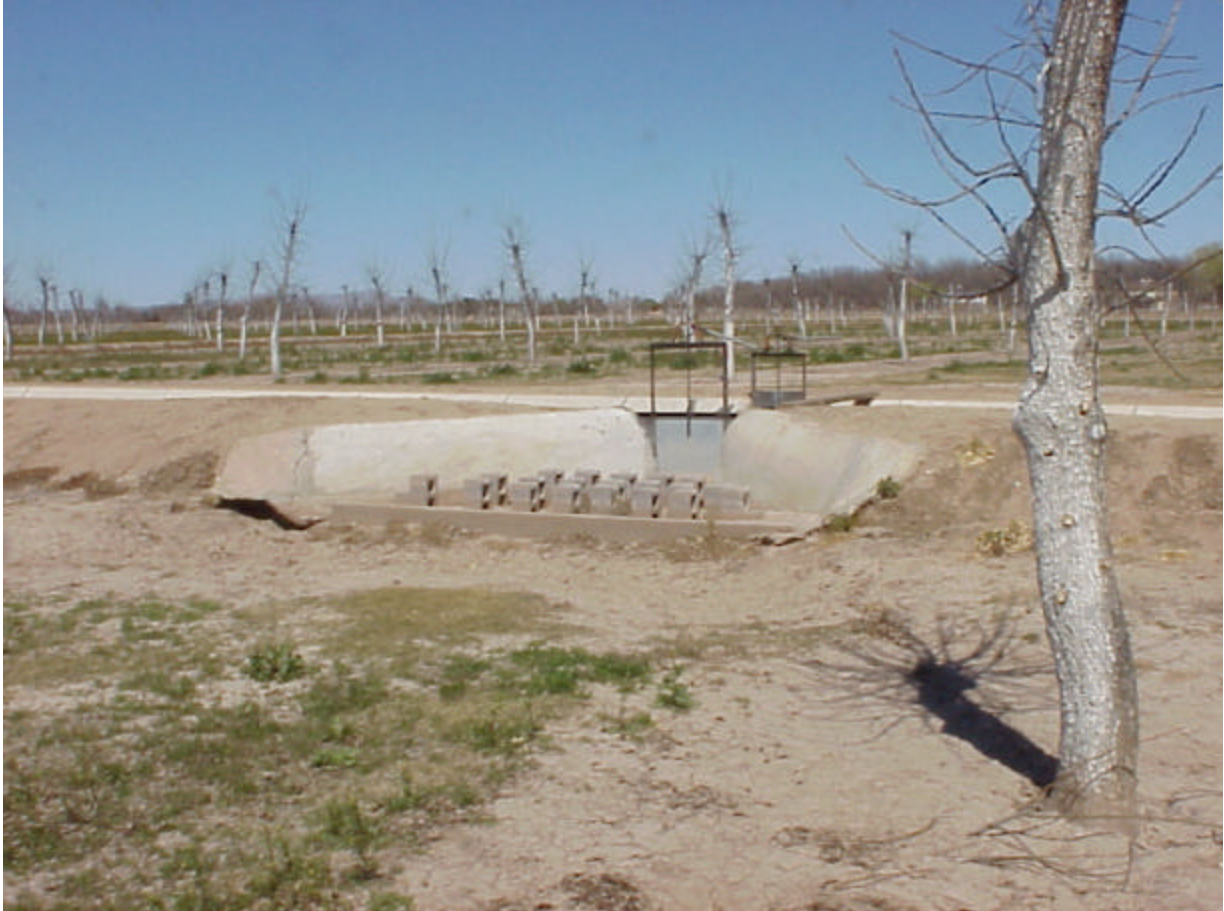
Figure 8.3: High Flow Turnout on Pecans in the Elephant Butte Irrigation District.